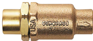
61-600 SOLDER 1/2" THROUGH 2"