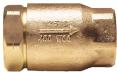
61-500 FEMALE x FEMALE THREADED 1/4" THROUGH 2"